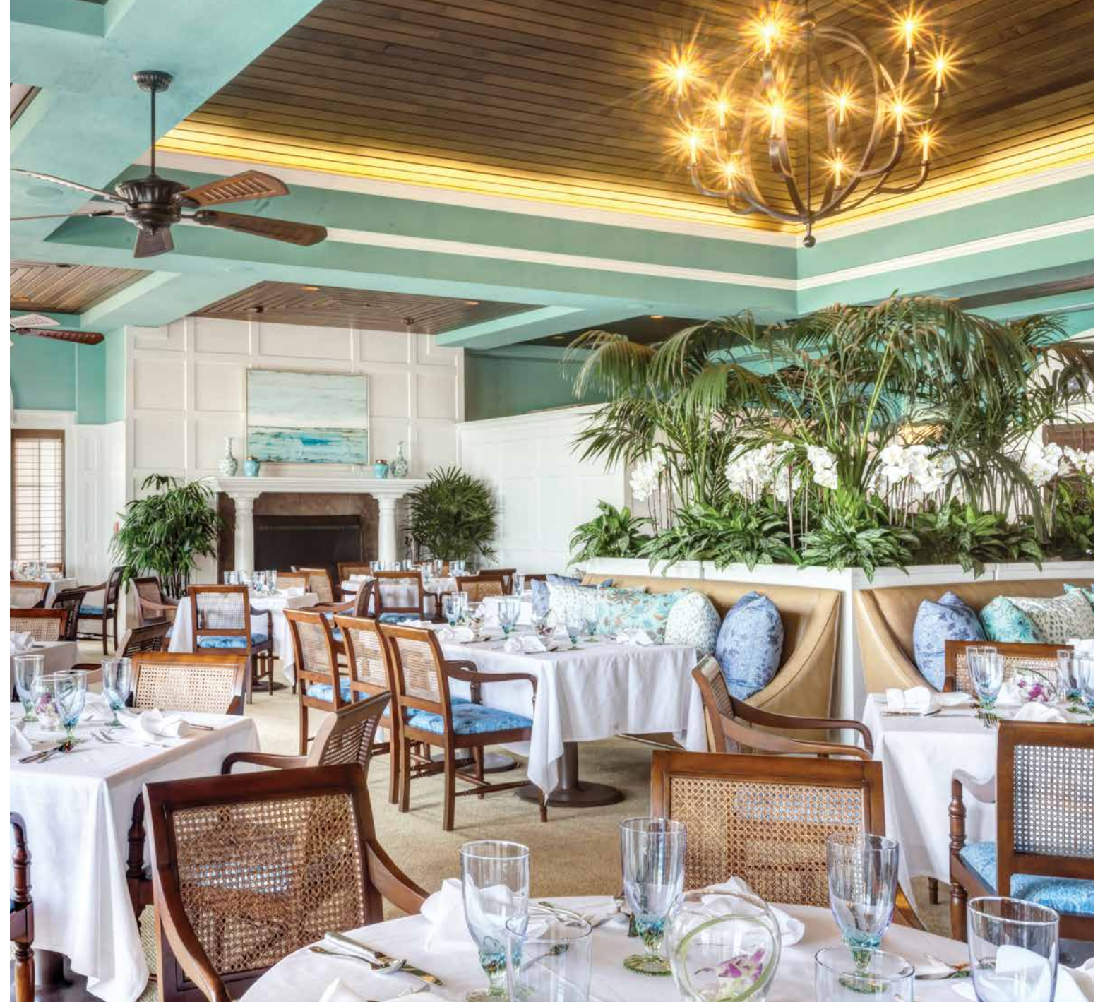
The dining room features a four-piece floral island that can be rearranged to accommodate special events. With fresh colors and a sparkling chandelier, the former “multi-purpose room” has returned to its original intent — that of sharing meals with friends and family.

“Back then the original batiks were very hard to find; they also