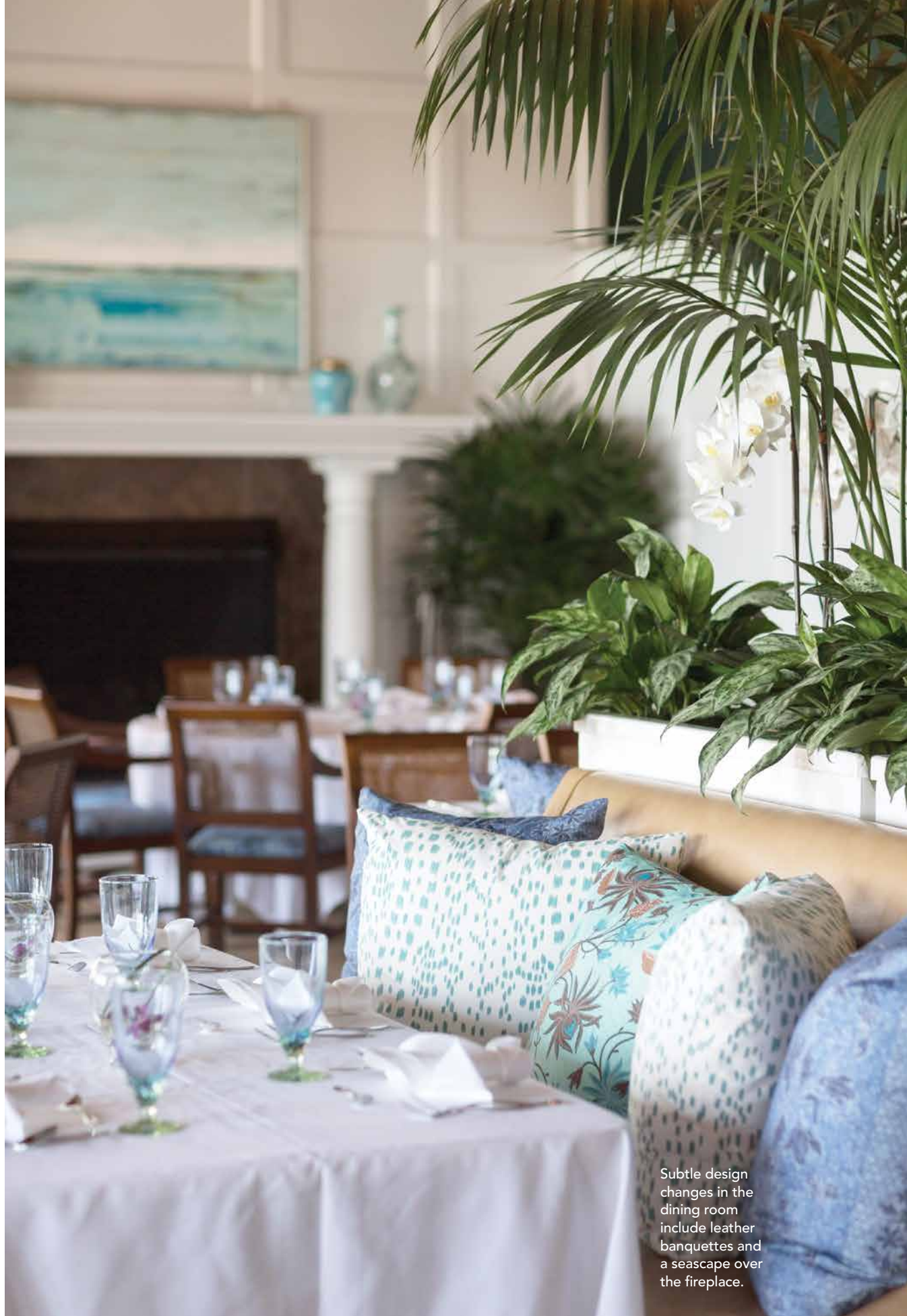
Subtle design changes in the dining room include leather banquettes and a seascape over the fireplace.