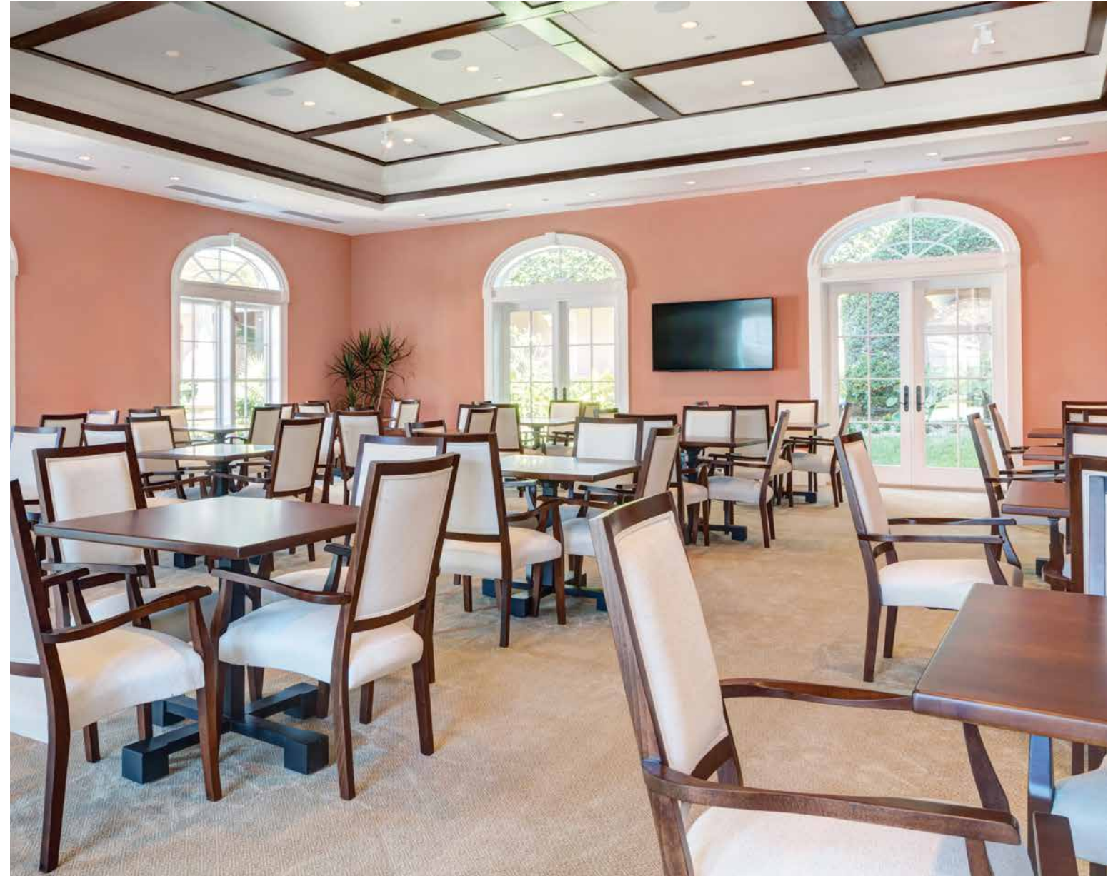
The new multi-functional Sandpiper Room serves a myriad of uses. For that reason, Smith selected tables with castors on the legs and tops that flip up, accommodating the need to rearrange or store away.

we had them stripped, re-stained and seats re-caned when needed. We also added some new pieces. It was a logistics nightmare as we had to figure out where everything was going to go.”