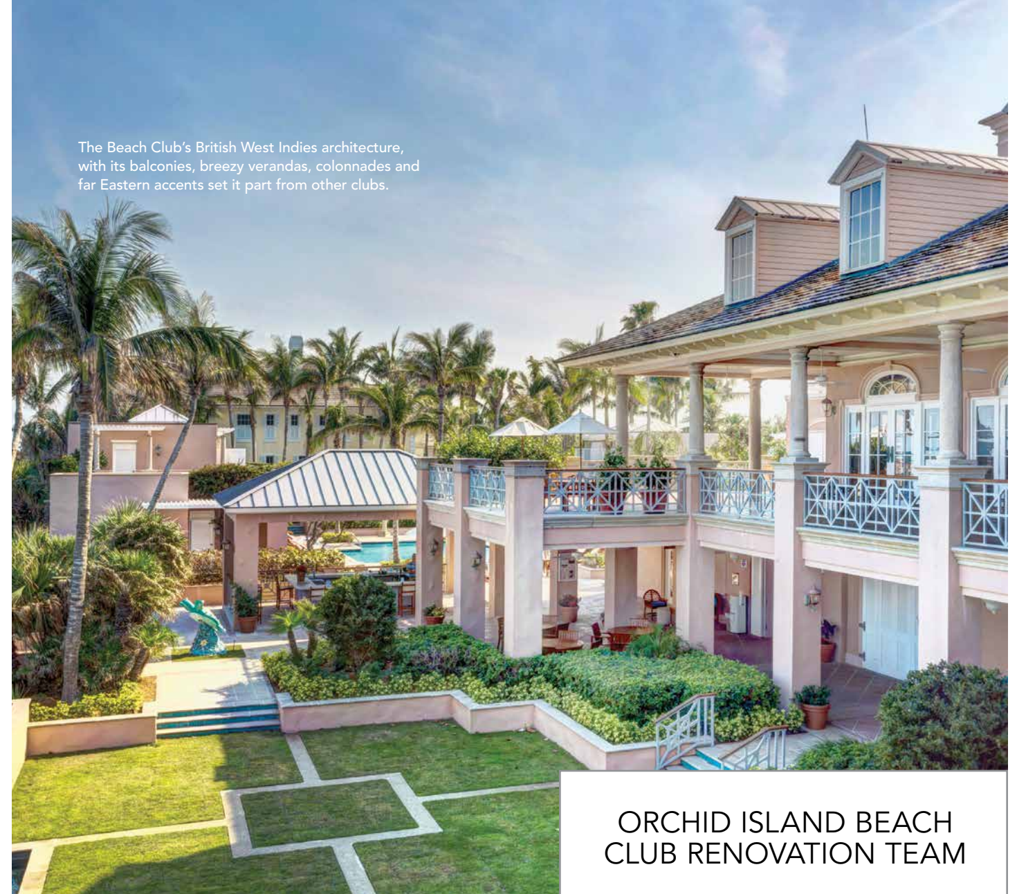
The Beach Club's British West Indies architecture, with its balconies, breezy verandas, colonnades and far Eastern accents set it part from other clubs.