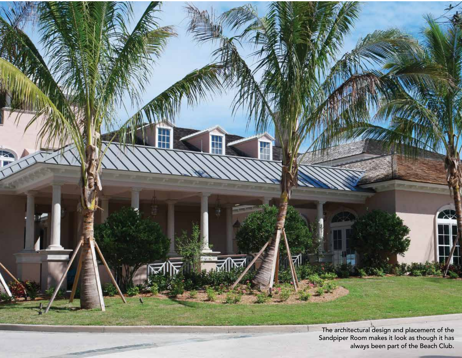
The architectural design and placement of the Sandpiper Room makes it look as though it has always been part of the Beach Club.