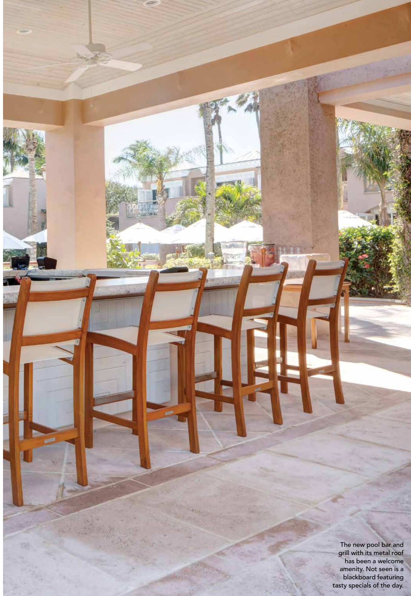
The new pool bar and grill with its metal roof has been a welcome amenity. Not seen is a blackboard featuring tasty specials of the day.