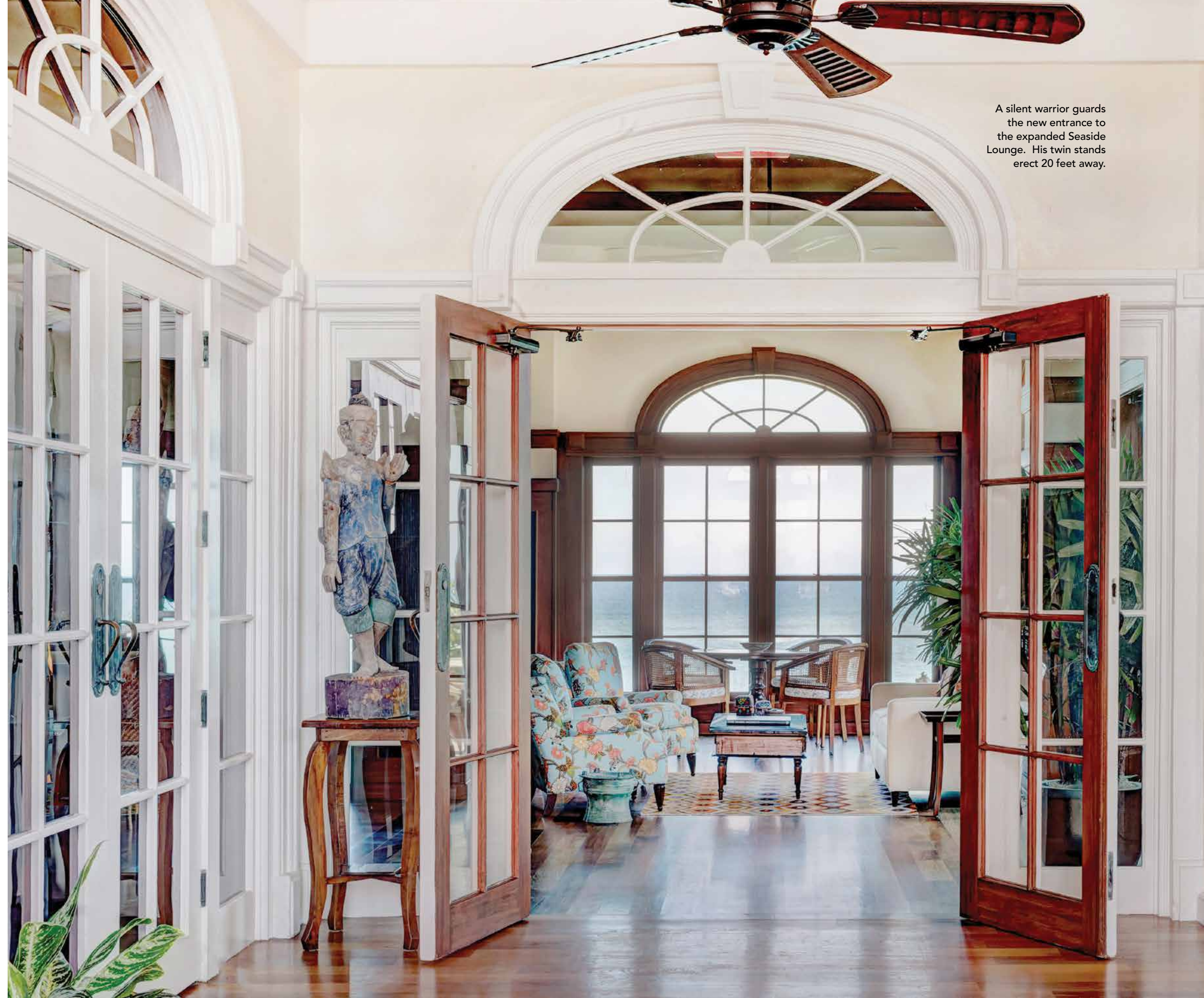
A silent warrior guards the new entrance to the expanded Seaside Lounge. His twin stands erect 20 feet away.

Four topped the list: the pressing need for a multipurpose room, enlarging the second level Seaside Lounge, building a pool bar between the swimming pool and boardwalk leading to the ocean, and updating the dining room. Town meetings were held to review the