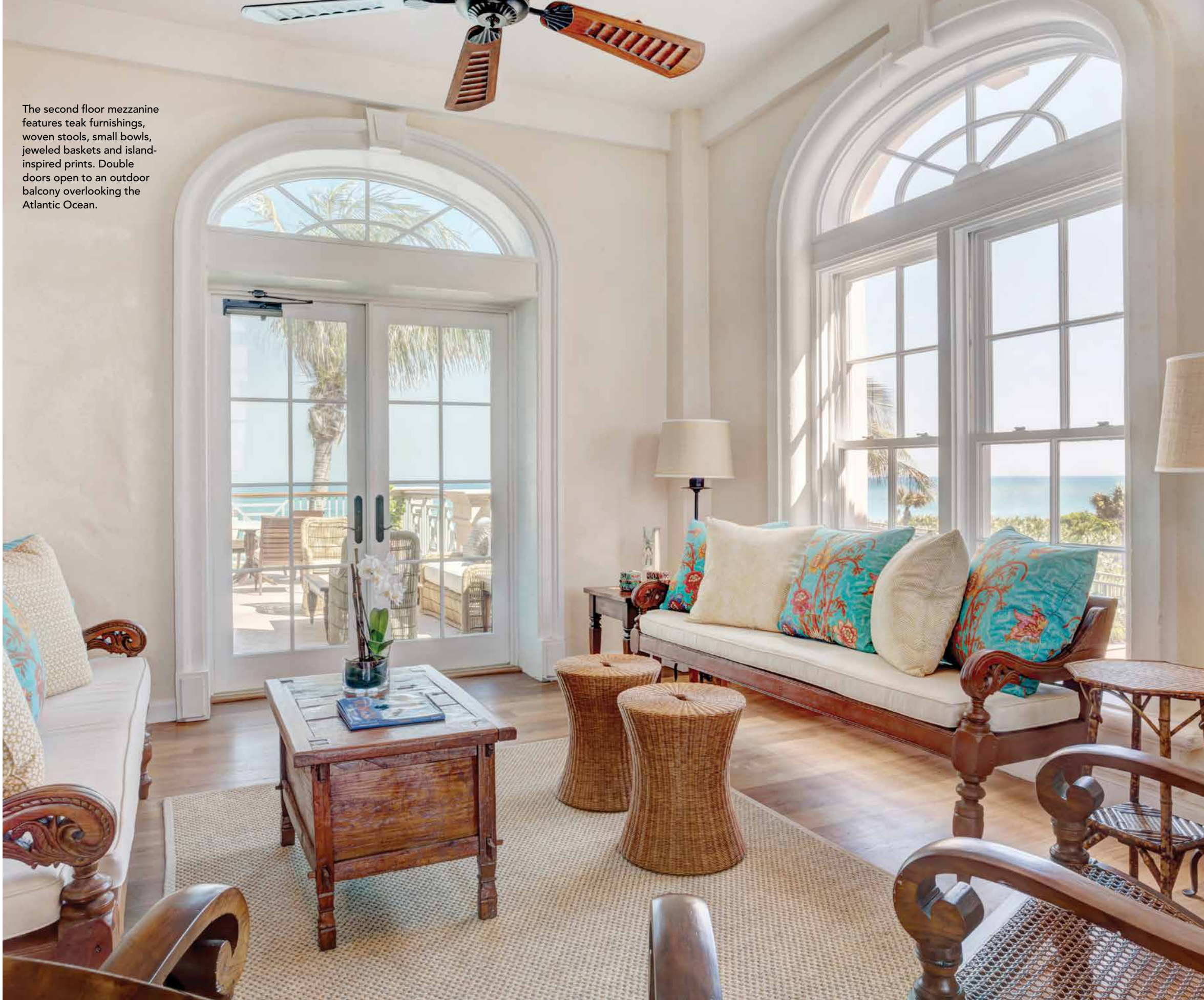
The second floor mezzanine features teak furnishings, woven stools, small bowls, jeweled baskets and island-inspired prints. Double doors open to an outdoor balcony overlooking the Atlantic Ocean.

The problem was simple. Orchid Island Beach Club's walls were bursting at the seams as over the past several years more and more activities and special events had been added to the monthly calendar. The dining room was the designated go-to place, and on days when as many as three events were scheduled at different times, members and staff found themselves bumping into each other as they rearranged tables and chairs to suit the situation's needs.